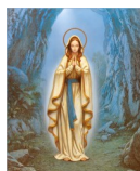
Feast of Our Lady of Lourdes

Read Pope Francis' full message here: Message for World Day of the Sick Further information: World Day of the Sick Website